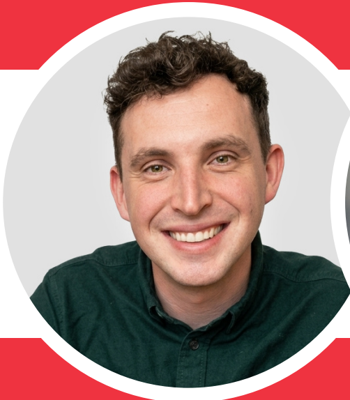
Sir Francis Avery Jones Visiting Professor

Royal College of Surgeons, 38–43 Lincoln's Inn Fields, London WC2A 3PE