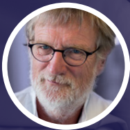
Sir Alan Parks

The Royal College of Physicians, London, UK